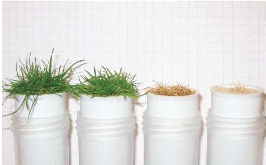
Penn A-1 creeping bentgrass grown in soils with decreasing levels of potassium from left to right; keeping soils at or above the MLSN guideline provides a level of safety that such deficiency symptoms will not occur.

This creeping bentgrass green at Takarazuka GC near Osaka, Japan, has calcium, magnesium and potassium levels not only below the conventional guidelines, but also below the MLSN guidelines, yet still has produced excellent turfgrass conditions since the soil was first tested in 2009.