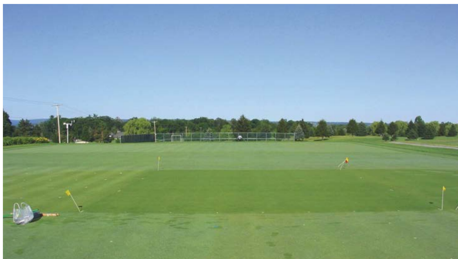
In experiments with creeping bentgrass at Cornell University, a wide range of soil potassium levels were established in these research plots, but no benefit to applied potassium was observed even when the soil potassium levels were well below the conventional guidelines.

pare the MLSN guideline value for an element to the soil test level for that element. If the element is below the MLSN guideline, or if the estimated use of that element will drop the soil to the MLSN guideline during the course of the growing season, then that element should be applied. If the element, as measured by the soil test, is above the MLSN guideline, and if estimated use of that element during the growing season will keep the soil above the MLSN guideline, then that element is not required as fertilizer.