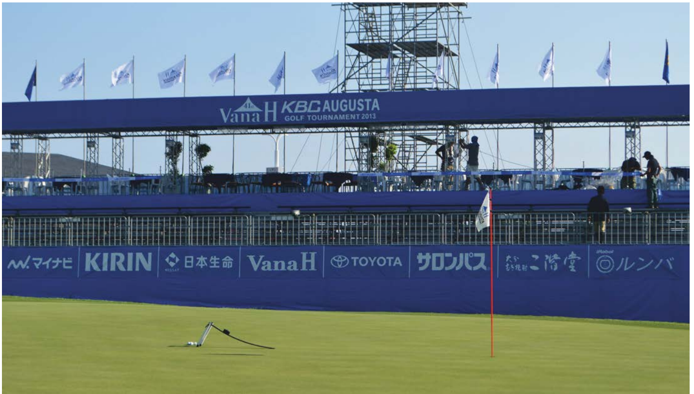
High-performance turf at Keya GC near Fukuoka, Japan, is maintained in soils with sulfur and magnesium near the MLSN guideline and potassium below conventional guidelines. Adding data from sites like this helps to improve the accuracy of the guidelines as they are updated.

With MLSN, we take a different approach, taking the data from thousands of sites with good performance, assuming that there must be enough nutrients available to produce good turf because the sites are already performing well, and then selecting a conservative value at the 0.1 level at the lower end. Because we have already omitted the sites with bad performance from our data set, we can have some confidence that these apparently low levels are sufficient to meet the requirements of the grass.