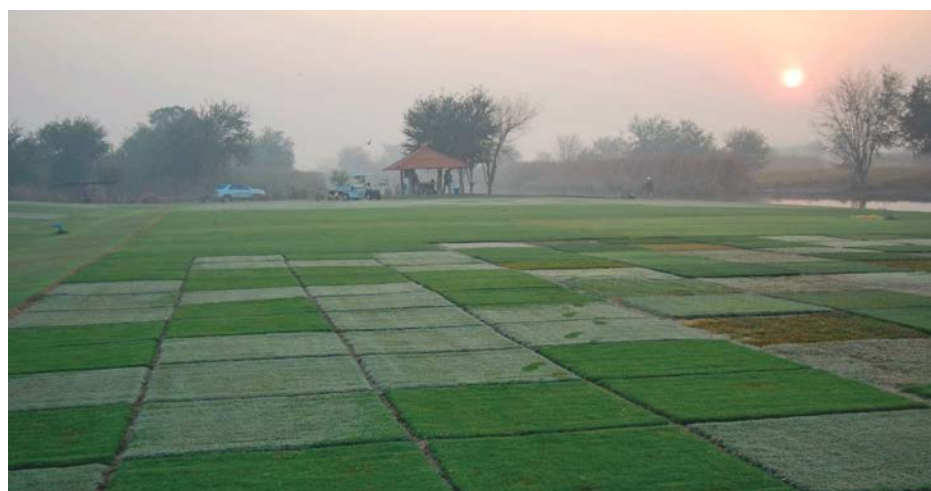
From 2006 to 2009, more than 50 varieties of warm-season grasses were grown at the Asian Turfgrass Center research facility north of Bangkok in soils with nutrient levels below the conventional soil guidelines, yet the turf still met all performance goals.

We added one more filter to the data. This was for pH. We selected only those samples